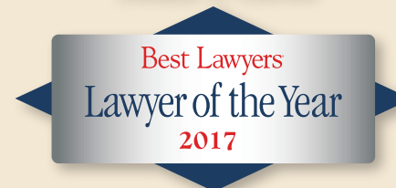
Personal Injury Litigation - Plaintiffs Tampa, FL